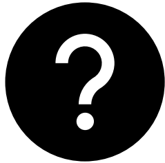
Child Care Director